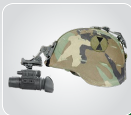
PS15 WITH HELMET MOUNT ASSEMBLY