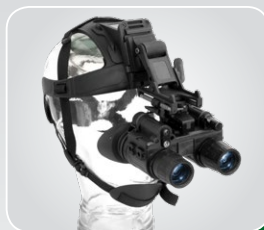
PS15 WITH HEAD MOUNT ASSEMBLY

* Specifications are provided for informational purposes only. Actual values may vary