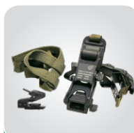
PADST HELMET MOUNT KIT ACGOPS15HMNP