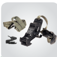
MICH HELMET MOUNT KIT ACGOPS15HMNP