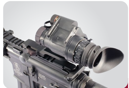
ODIN WEAPON SIGHT