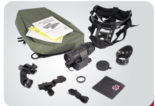
ODIN WEAPON MOUNT KIT