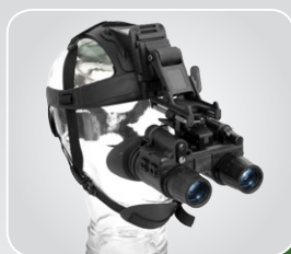
PS15 WITH HEAD MOUNT ASSEMBLY

** Specifications are provided for informational purposes only. Actual values may vary