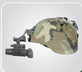
PS15 WITH HELMET MOUNT ASSEMBLY