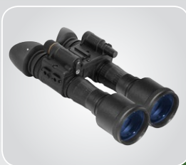
PS15 WITH 3X LENS