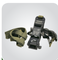
PADST HELMET MOUNT KIT ACGOPS15HMNP