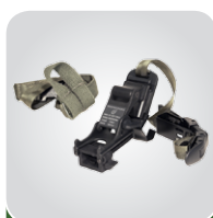
MICH HELMET MOUNT KIT ACGOPS15HMNP