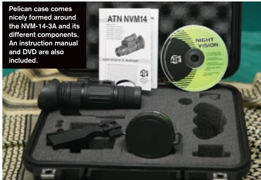
Pelican case comes nicely formed around the NVM-14-3A and its different components. An instruction manual and DVD are also included.

For example, the IRI was a must when testing out the unit in a room without windows. Another sound application would be for reading a map within a vehicle or needing to observe something at close range with high clarity or attention to detail. The ATN NVM-14-3A features a focusing lens for the IRI that can be