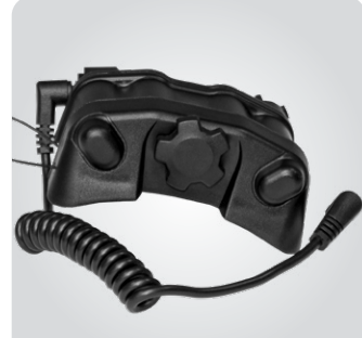
BATTERY PACK (optional)