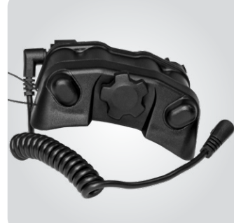
BATTERY PACK (optional)