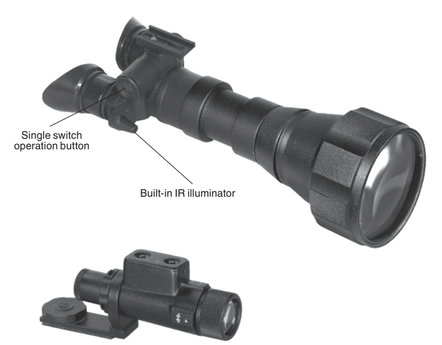
Infra-red illuminators IR450