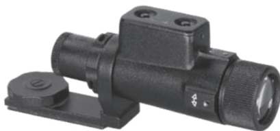
Infra-red illuminators IR450